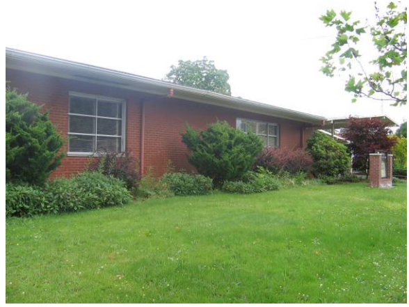
East elevation facing northwest