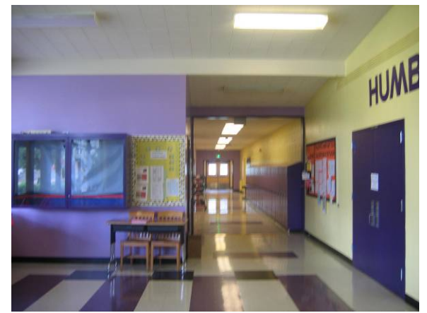
Corridor facing west