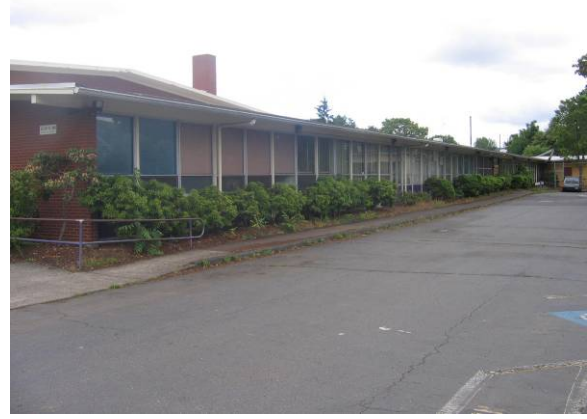
North elevation facing west