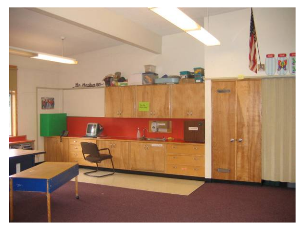
Classroom built-in facing west